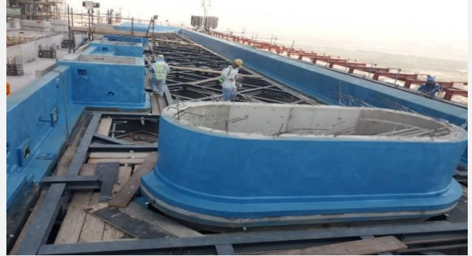
After – Elastocoat application