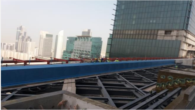
Before -Elastocoat application